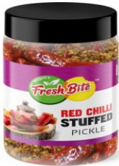
STUFFED RED CHILLI PICKLE