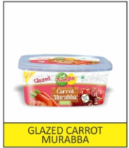
GLAZED CARROT MURABBA