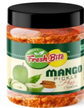
MANGO PICKLE HING