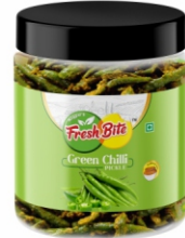
GREEN CHILLI PICKLE