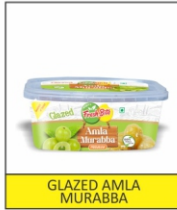
GLAZED AMLA MURABBA