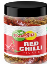
RED CHILLI PICKLE