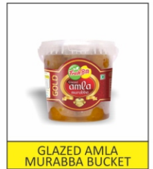
GLAZED AMLA MURABBA BUCKET

Packing: 1 Kg, 5 Kg, Gifts Packs & Commercial Packs Available Here