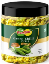
GREEN CHILLI PICKLE GOLD