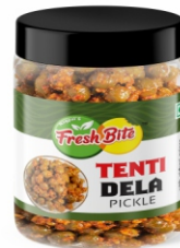
TENTI DELA PICKLE