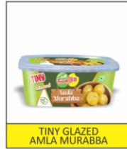
TINY GLAZED AMLA MURABBA