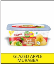
GLAZED APPLE MURABBA