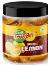
SWEET LEMON PICKLE