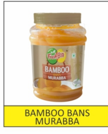
BAMBOO BANS MURABBA