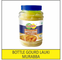
BOTTLE GOURD LAUKI MURABBA