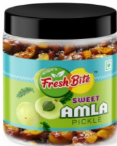
SWEET AMLA PICKLE